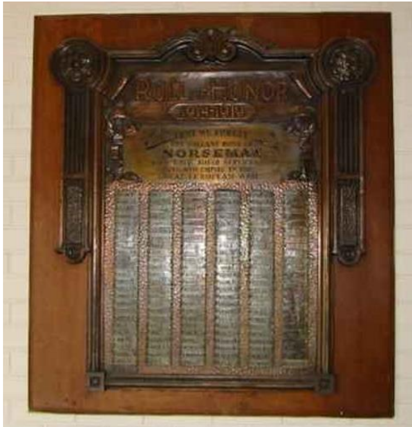
Norseman Roll of Honour