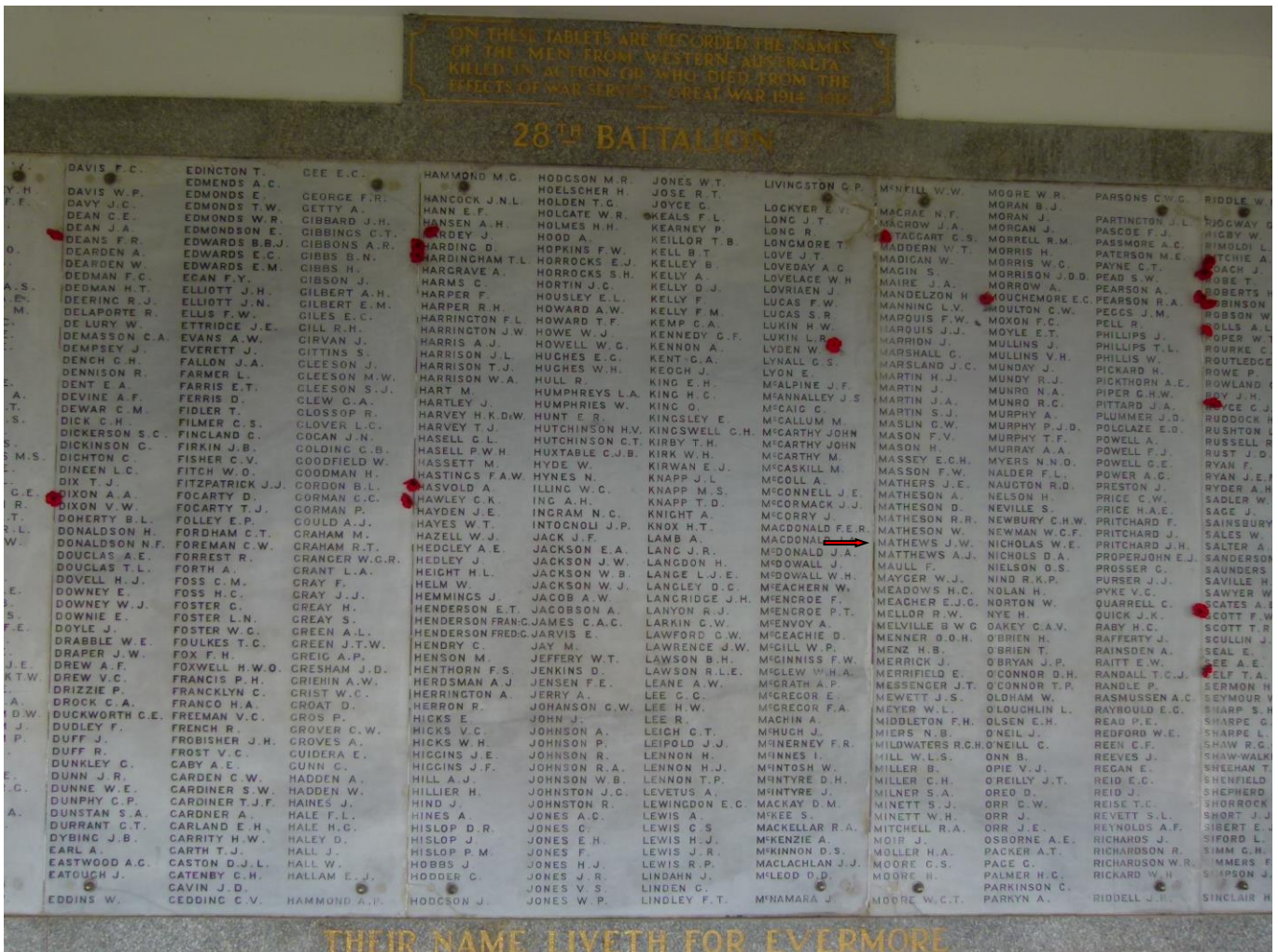
28th Battalion Panel