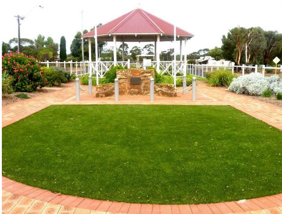
Norseman War Memorial

The Norseman War Memorial, located in Rotunda Park, Prinsep Street, Norseman, Western Australia does not list individual names.